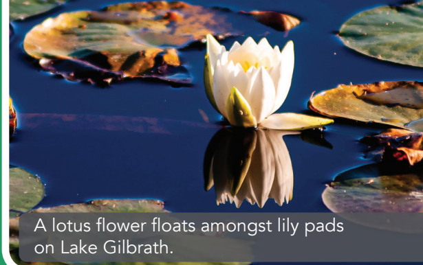
A lotus flower floats amongst lily pads on Lake Gilbraith.