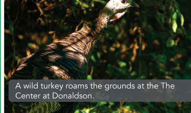
A wild turkey roams the grounds at the The Center at Donaldson.