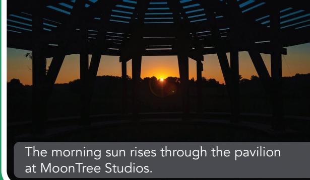
The morning sun rises through the pavilion at MoonTree Studios.